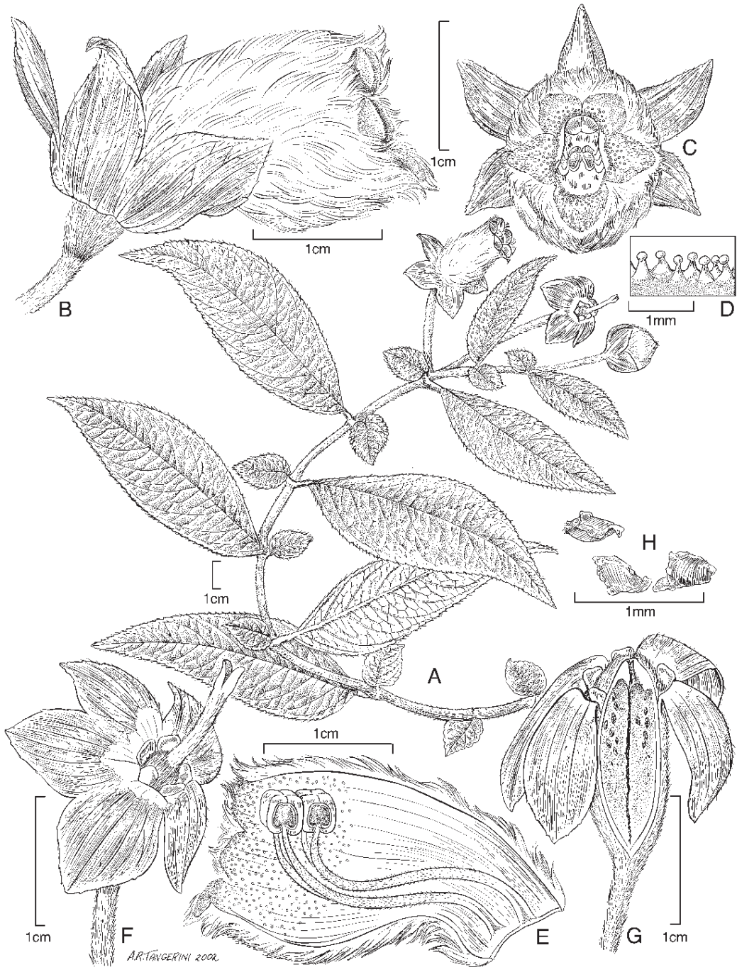
FIG. 2. Kohleria hypertrichosa J.L. Clark & L.E. Skog A. Habit. B. Side view of flower. C. Face view of flower. D. Glandular trichomes on mouth of corolla. E. Corolla opened to show stamens. F. Calyx opened and corolla removed to show valvate nectary glands. G. Mature fruit. H. Seeds. (A–H from J.L. Clark et al. 6359).