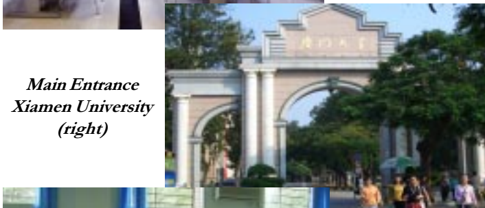
Main Entrance Xiamen University (right)