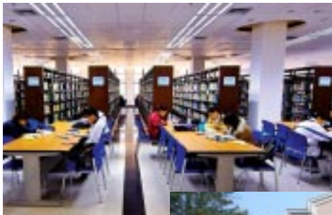
Main Library Xiamen University (left)

Prior to departure, students will read about topics concerning Chinese communication, culture, and commerce. Students will develop Chinese conversational skills, make visits to historically significant sites, learn Chinese culture, business, government, ethnic groups, and foreign policies by attending English lectures by distinguished Chinese professors and subject matter experts. After-class explorations will expose students to everyday Chinese life.