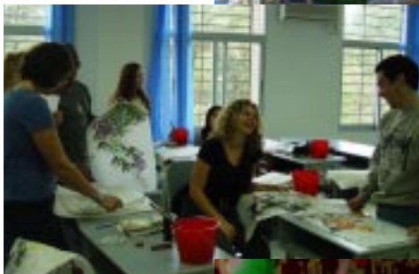
Cultural Activities (left)