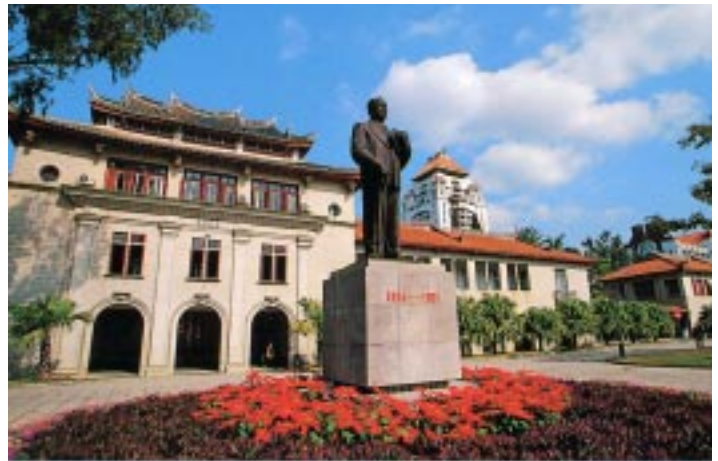
Statue of Xiamen University's Founding Father Mr. Tan Kah Kee