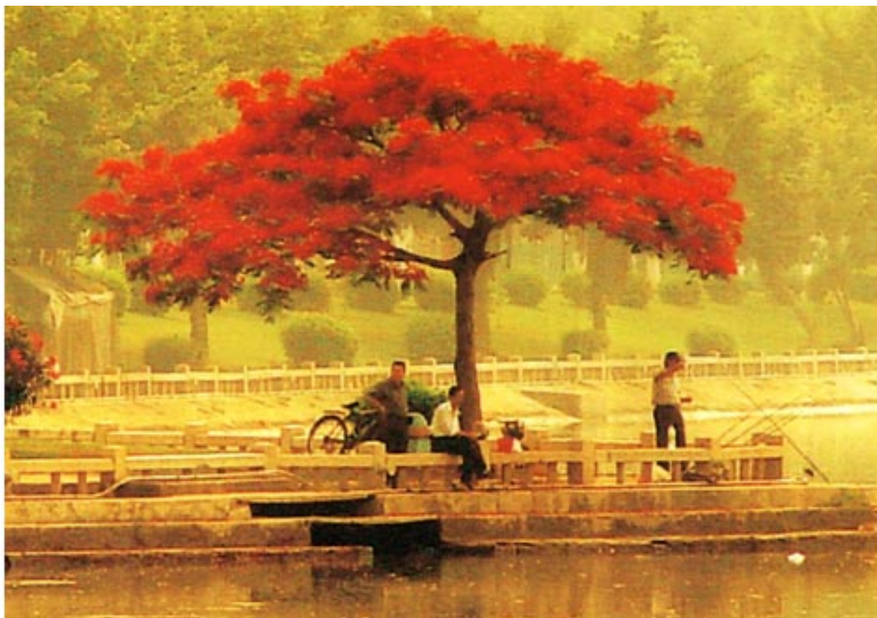
Life in Xiamen, China

The University of Alabama is an equal-opportunity educational institution/ employer.