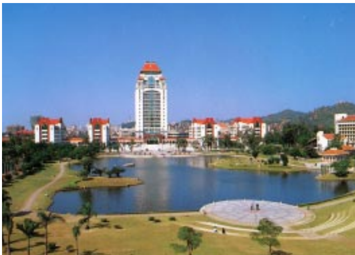
Xiamen University Campus